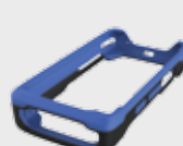
■ 94ACC0132 Rubber Boot