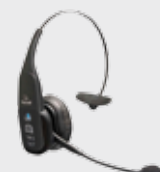
■ 95ACC0002 Bluetooth® Headset VX1 B350-XT