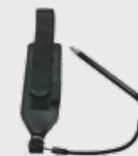
■ 94ACC0133 Hand Strap (Included with purchase)